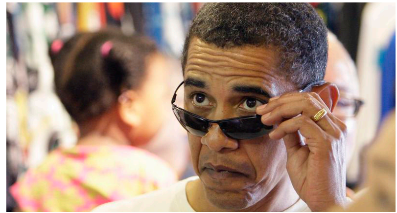
When asked what he thought of the cold snaps enveloping the north, President Obama is quoted as saying, "Bitch, I am the president of the United States. I do not have a single gram of fuck to give about the cold."