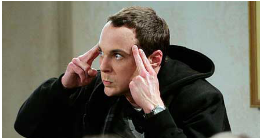
“If you don't go out and do something to celebrate asexual awareness week, I'll make your head explode all over. Wait, how is that a sexual innuendo?”

...see Sexual In your endo? What? on back